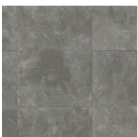
Concrete Stain Naturelle TPWPDLO421