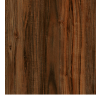
Natural Acacia TPWP0411