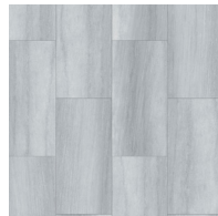
Italian Stone Grigio TPWPDLO419