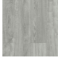
Ocean View TPWP0410