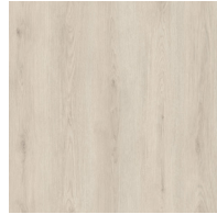
Nordic Oak TPWP0414