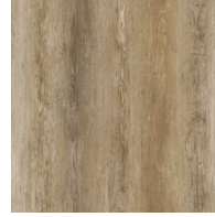
Northern Pine TPWP0404