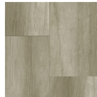
Italian Stone Crema TPWPDLO420