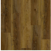
Canyon Hills TPWP0405