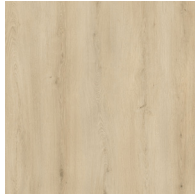
Scandinavian Oak TPWP0413