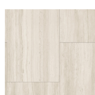
Limestone Vein Cut TPWPDLO424