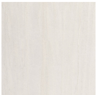
Pello Rock Natural TPWPDLO417