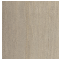
Pello Rock Sandstone TPWPDLO418