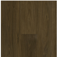
American Walnut TPWP0412