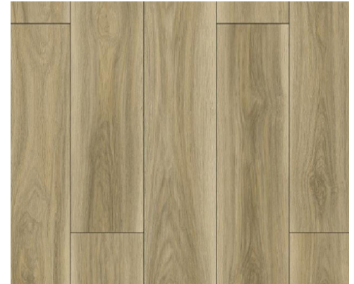
Belle | AGRCU0106