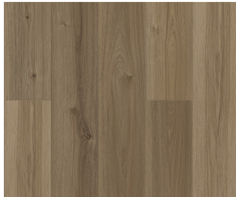
Bridger | NFRCU0108