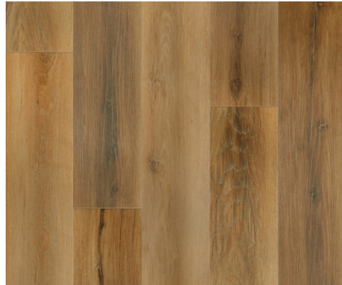
Peak | NFRCU0102