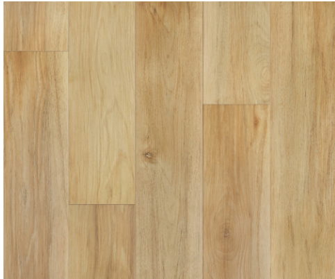
Incline | NFRCU0101